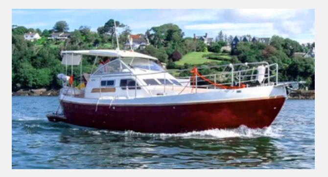
Courier 970 - 1 Yacht