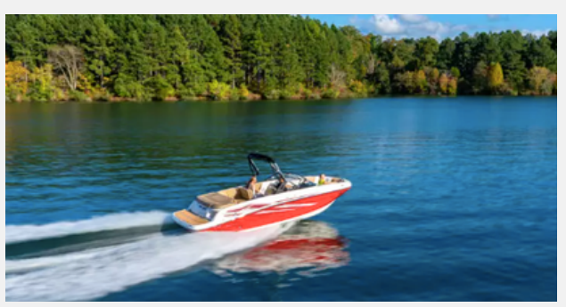
Bayliner VR6 - 1 Vessel