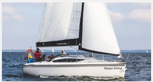
Maxus 33.1 RS - 5 Yachts